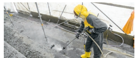
1st gear – low pump power for manual blasting gun work