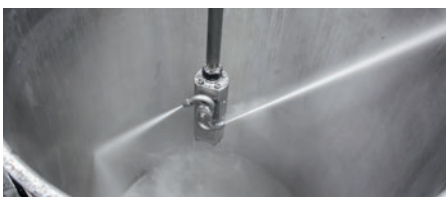
3rd gear – full pump power as typically employed for tank cleaning