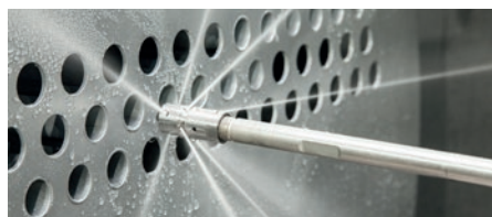
2nd gear – medium pump power i.e. for pipe and tube bundle cleaning