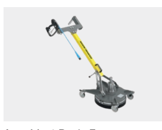
Aquablast Basic E

The smallest of our Aquamat tank cleaning units impresses with its patented HPS technology, which is also used in our Masterjet rotor jets.